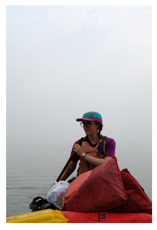
Sac Dene, 2023